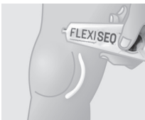
Apply the gel evenly around the joint.